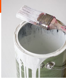
Paints & stains

BRING THESE MATERIALS TO THE RCC TO BE DISPOSED OF PROPERLY