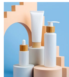
Health & beauty products